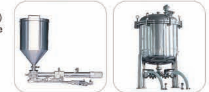
Optional device(According to products)