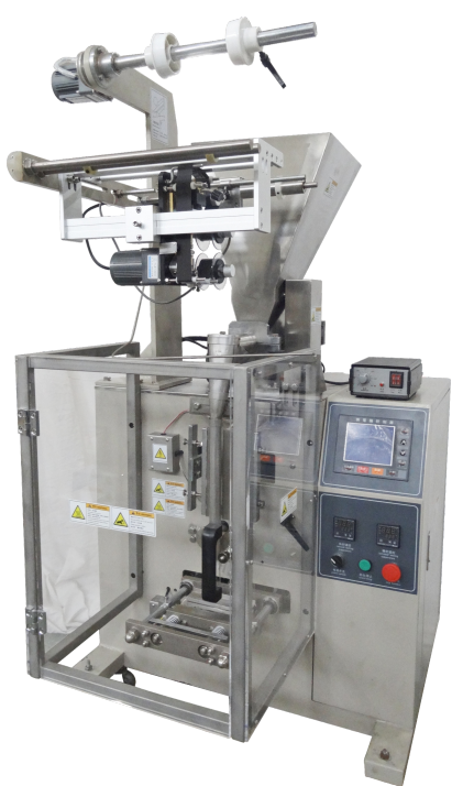
Automatic Powder Packaging Machine