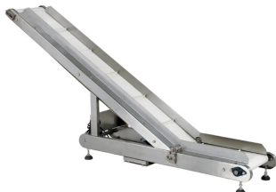
LARGE FINISHED PRODUCT CONVEYOR