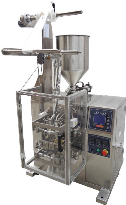
Automatic Liquid And Paste Packaging Machine