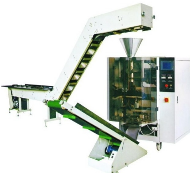
Semi-automatic vertical type