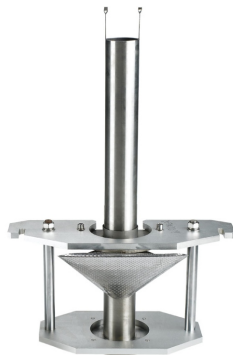
CSAR STYLE FORMER