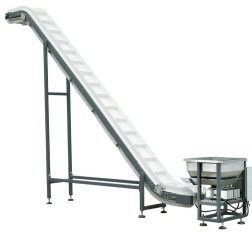
LARGE MATERIAL ELEVATOR