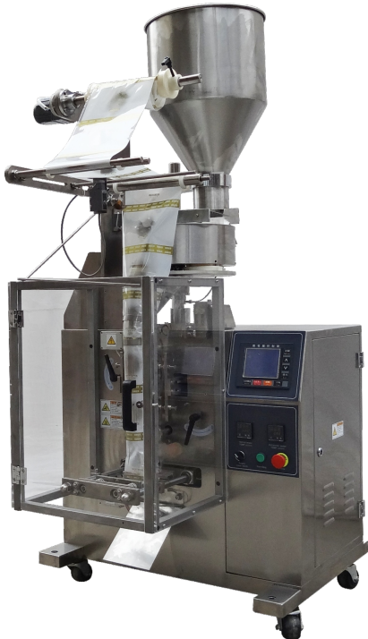
Automatic Granule Packaging Machine