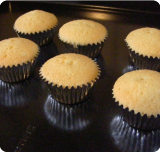
Suitable for products with tray