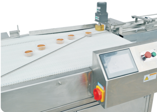
PLC controlling, Omron HMI

This automatic Packaging machinery has completely changed the maunal materials discharging and packaging mode of traditional manufacturers since it applies fully automatic materials feeding ,the products are fed into the packaging line from the production line,which may automatically adjust the speed and position of the products,thus making the products enter into the packaging machine orderly and correctly.Automatically control the start,stop and speed of the packaging machine according to the state of product,completely free of manual control.